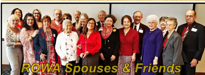
ROWA Spouses & Friends