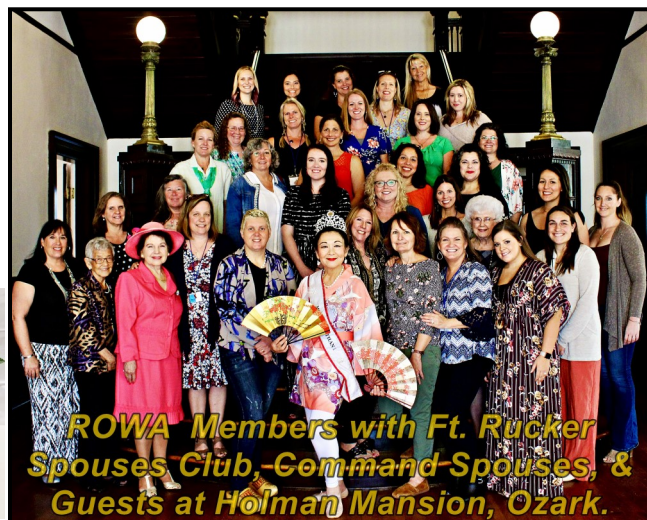
ROWA Members with Ft. Rucker Spouses Club, Command Spouses, & Guests at Holman Mansion, Ozark.

As the winds of concern pass over America, we face a rare challenge with solution yet unknown. Yes, we should be cautious, keep sanitary instructions, follow guidelines. Yet, we can know that the sun still shines, the earth still moves, and flowers still grow. The meaning of the flowers gives us inspiration to follow their meanings: that of faith, hope, confidence, compassion, and joy. Scripture declares in 2 Timothy 1:7 that God has not given us a spirit of fear, but of power, and of love, and of a sound mind. We can still count our blessings, pray, serve, and look upward to a higher power.